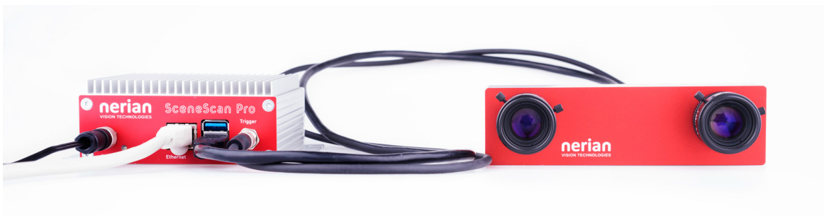
Figure 3: Karmin3 connected to SceneScan Pro.

The trigger signal must provide an appropriate trigger frequency that can be matched by the cameras and the selected SceneScan model. The possible frequencies for different system configurations are listed in Table 3. In low-light situations the desired frame rate might not be achieved if the sensor exposure time is too high. In these cases, an appropriate exposure time upper limit should be configured in the SceneScan settings.