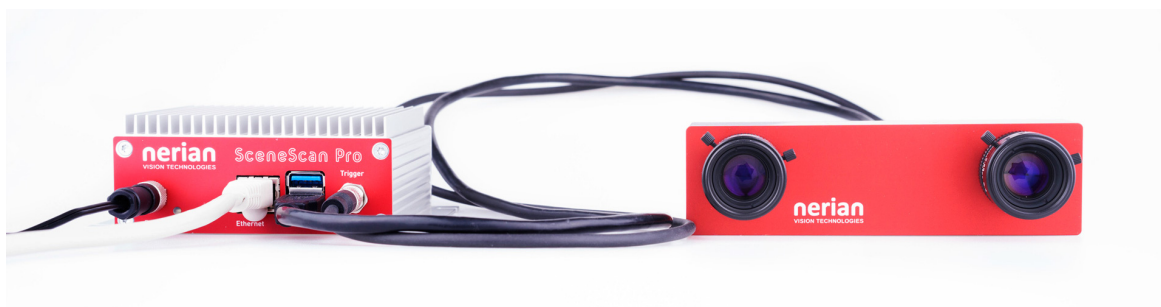
Figure 3: Karmin3 connected to SceneScan Pro.

The trigger signal must provide an appropriate trigger frequency that can be matched by the cameras and the selected SceneScan model. The possible frequencies for different system configurations are listed in Table 3. In low-light situations the desired frame rate might not be achieved if the sensor exposure time is too high. In these cases, an appropriate exposure time upper limit should be configured in the SceneScan settings.